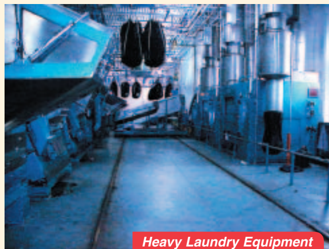
Heavy Laundry Equipment