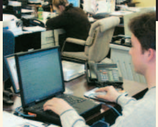
Station Pick-Ups & Deliveries