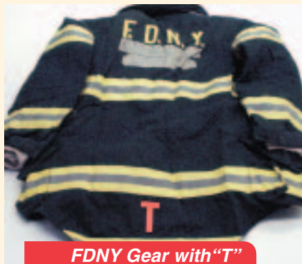
FDNY Gear with "T"