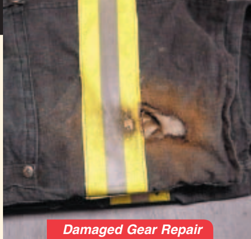
Damaged Gear Repair